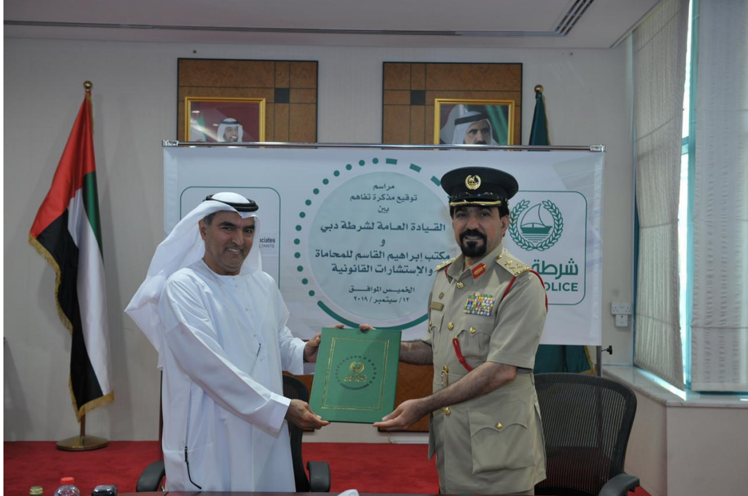
MOU between IA Firm & Dubai Police to provide Free Legal Consultations for Victims of Domestic Violence and Human Trafficking in Dubai